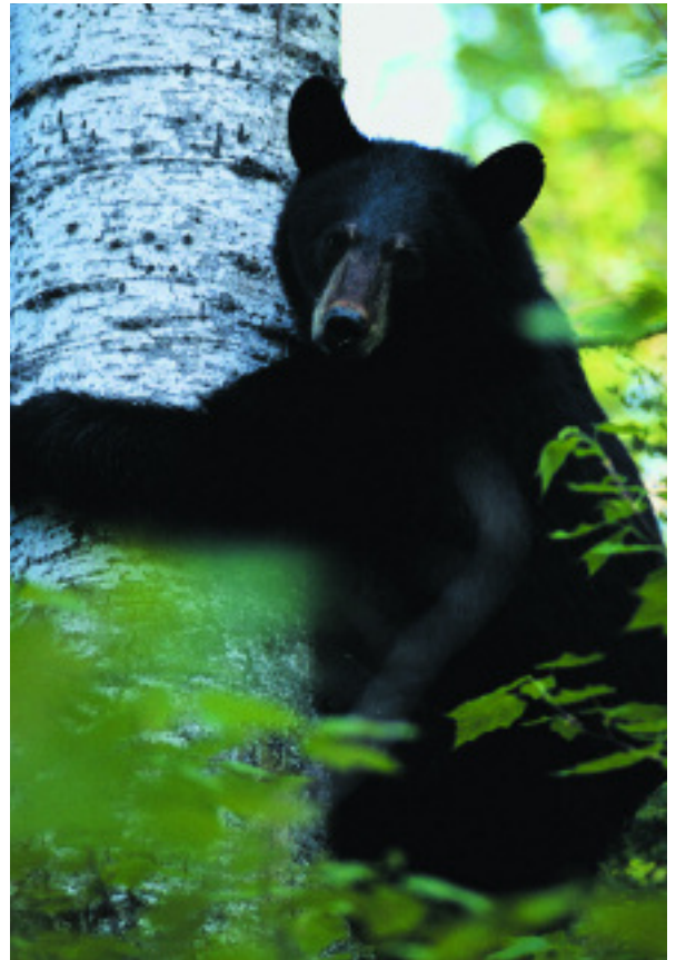
If he could speak, he would say... thank you!

For members who wish to be further involved , there are many important volunteer opportunities, such as CritterCan assembly, public education, and tabling events. Whether you support us as a volunteer or as a charitable donor, your involvement is much needed and greatly appreciated.